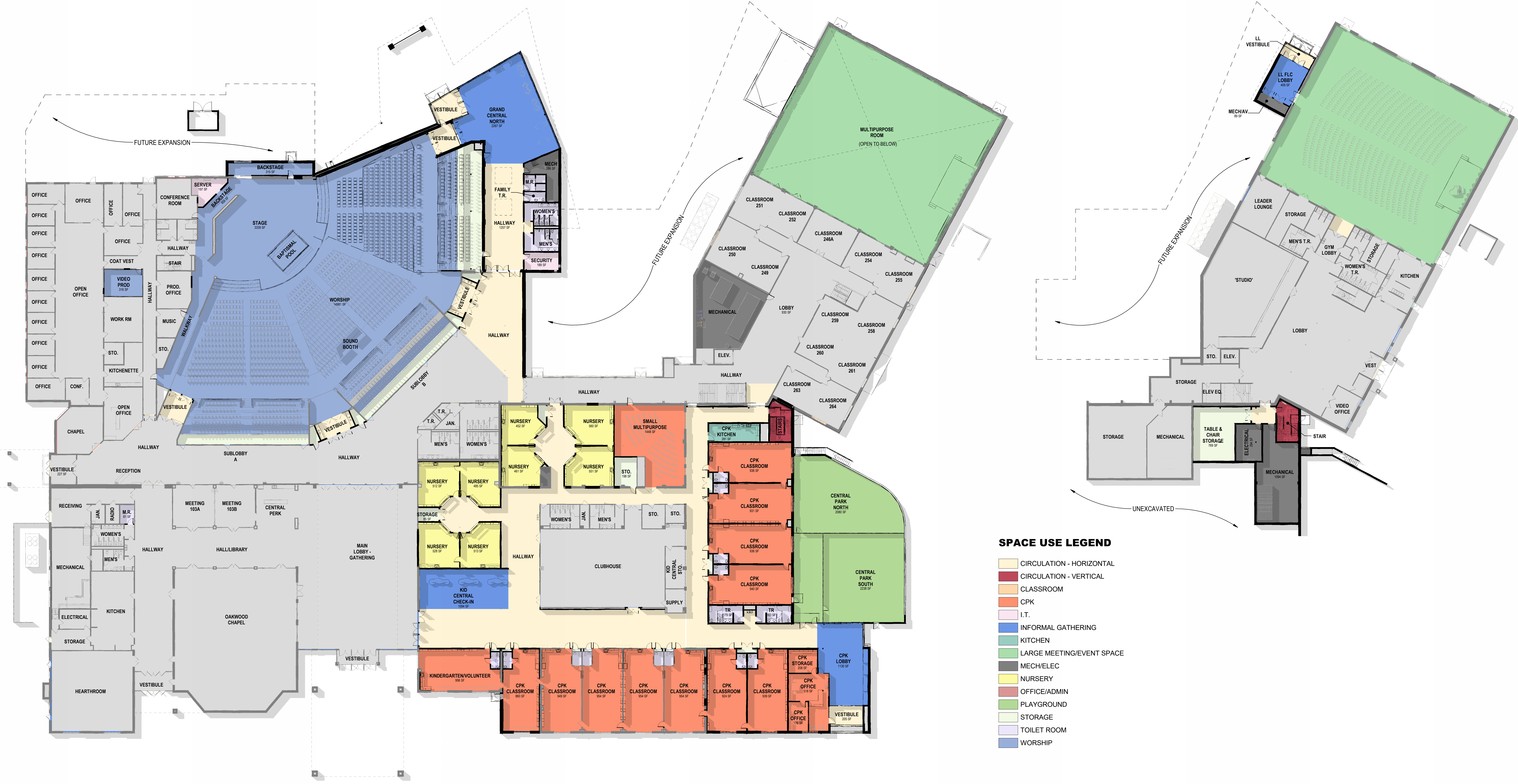
centralCHURCH - FIRST LEVEL SCALE: 3/64" = 1'-0"